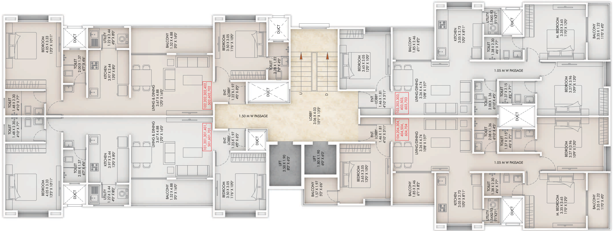
TYPICAL FLOOR PLAN (B WING)