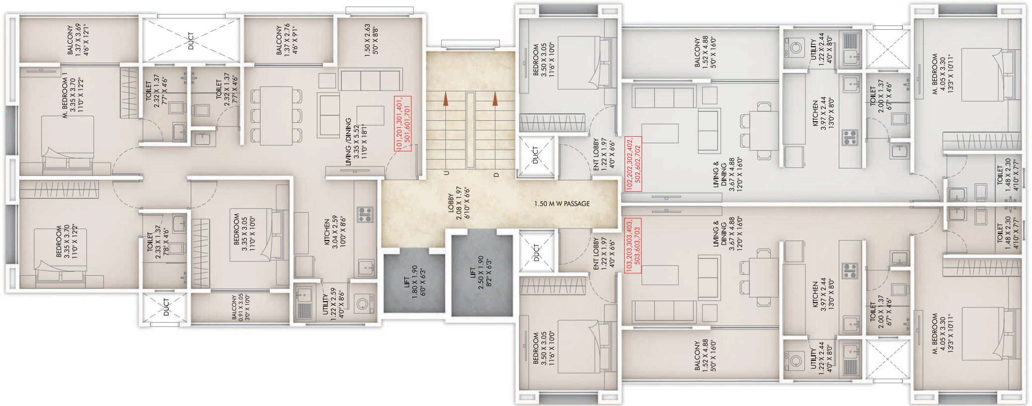
TYPICAL FLOOR PLAN (A WING)